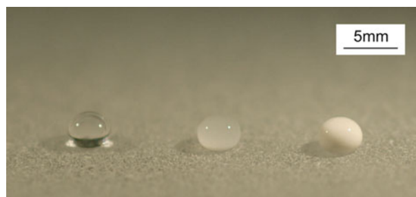
Fig. 2 Three kinds of suspension droplets of V_B = 30 \mu\text{L} fending off a hydrophobic surface. Left DI water, center \text{CaCO}_3 1.0 wt%, right \text{CaCO}_3 10 wt%

the shutter speed of 250 \mu\text{s} for the resolution of 1,024 \times 1,260 pixels. After released, the drops freely fell due to gravity and then impacted on the hydrophobic solid surface. During a drop falling, a small satellite droplet (so-called residue of the main drop) was observed following the main drop (Fig. 3, left). At the impact the drop deformed to a pancake shape (see the second column from left of Fig. 3) and dissipated the energy due to the surface tension. After bouncing of the drops, pinched-off of the DI water and dilute suspension drops (Fig. 3, top two rows) were observed (see the second column from right of Fig. 3), whereas the non-dilute (dense) suspension drop ( \text{CaCO}_3 10 wt%) remained the original drop without pinched off. The pinched-off droplet is smaller in the DI water experiment due to the lower viscosity, and consequently, reaches the highest position in the three kinds of droplets, as shown in the rightmost column of Fig. 3.